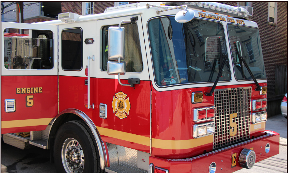
Philadelphia Fire Department, Engine 5

In the few areas where there is a functional fireplace, students must obtain approval for use. Before starting a fire, remove all combustible materials from the area and be sure the flue is open. Keep a screen in front of the fireplace while the fire is burning. Do not use liquid fuel starter and when using paper, limit the amount to avoid quick acceleration that could cause a flare up.