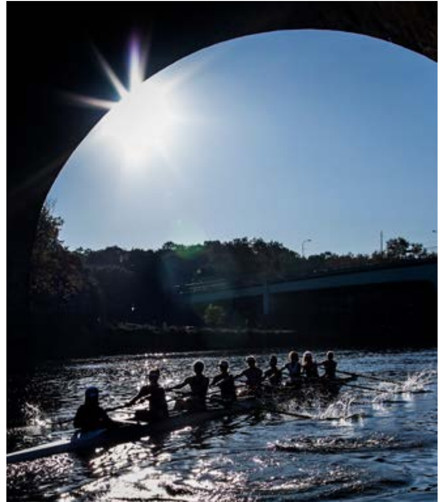
Penn Rowing (Boathouse Row)

The Clery Act, as amended, requires separate statistics for specified criminal incidents, arrests and disciplinary referrals for certain non-contiguous properties. The following statistics include reportable crime at non-contiguous properties specified for inclusion in this report for the period January 1, 2017, through December 31, 2019. These statistics conform to the specific definitions, time period and classifications specified by federal law.