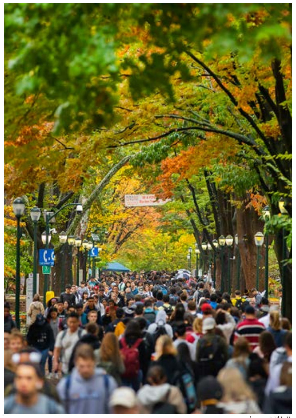
Locust Walk