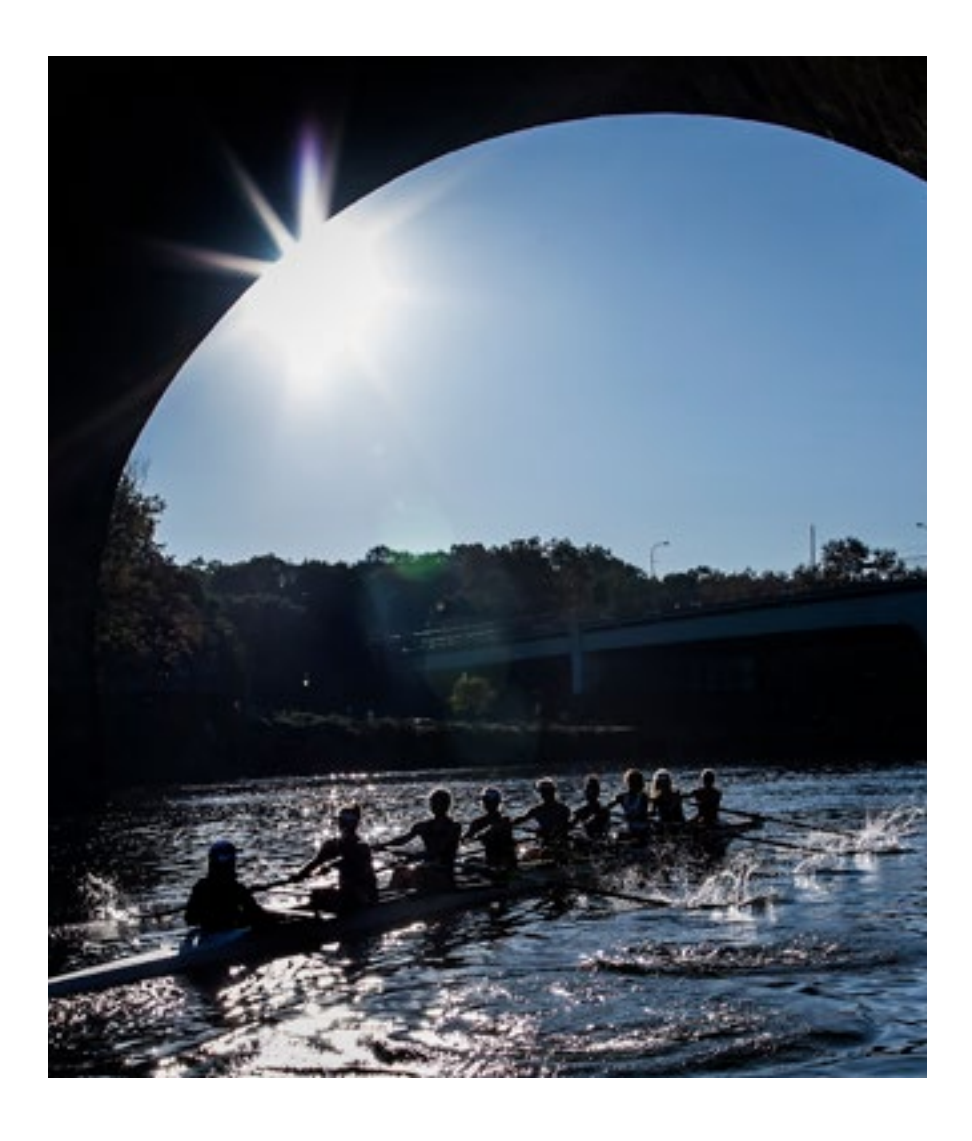
Penn Rowing

The Clery Act, as amended, requires separate statistics for specified criminal incidents, arrests and disciplinary referrals for certain non-contiguous properties. The following statistics include reportable crime at non-contiguous properties specified for inclusion in this report for the period January 1, 2018, through December 31, 2020. These statistics conform to the specific definitions, time period and classifications specified by federal law.