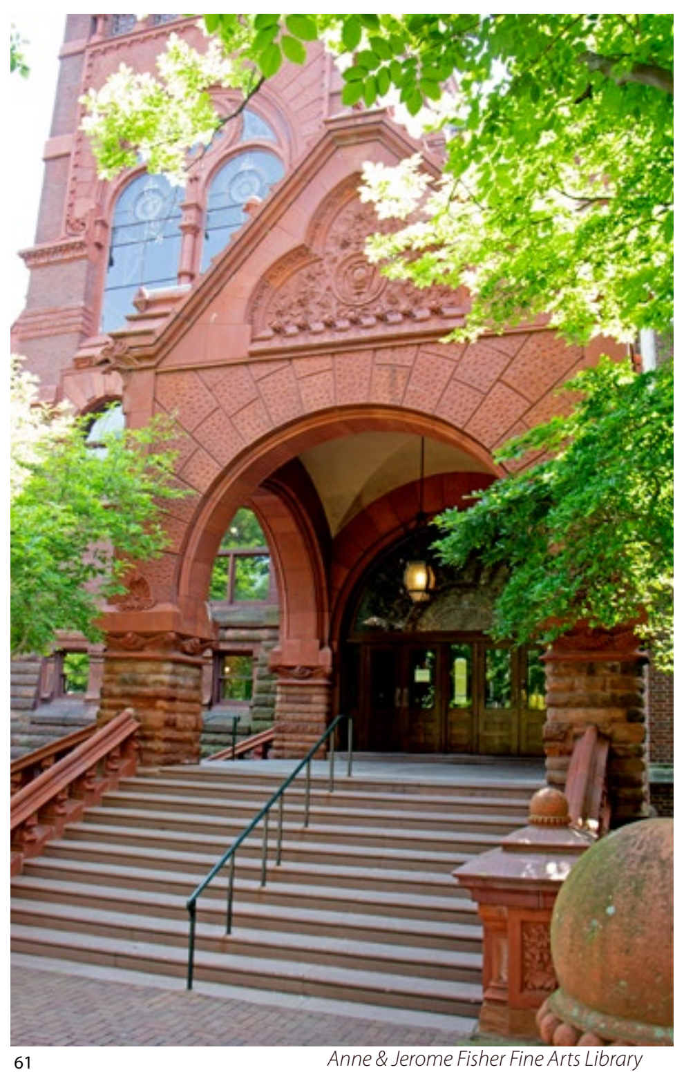
Anne & Jerome Fisher Fine Arts Library