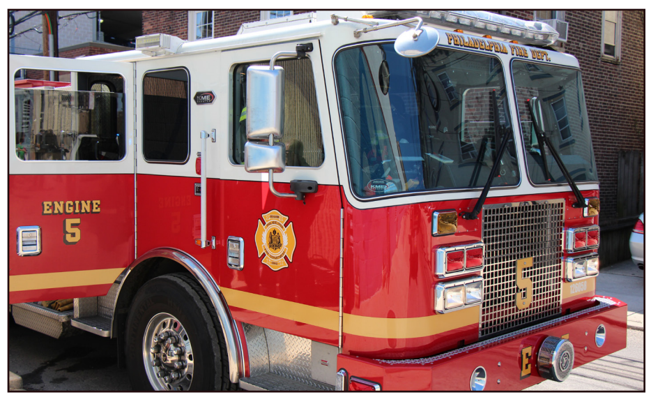
Philadelphia Fire Department, Engine 5

In the few areas where there is a functional fireplace, students must obtain approval for use. Before starting a fire, remove all combustible materials from the area and be sure the flue is open. Keep a screen in front of the fireplace while the fire is burning. Do not use liquid fuel starter and when using paper, limit the amount to avoid quick acceleration that could cause a flare up.