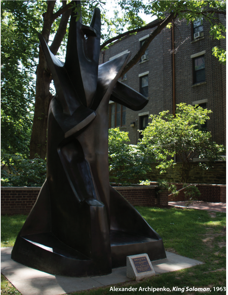
Alexander Archipenko, King Solomon , 1963

The Clery Act, as amended, requires separate statistics for specified criminal incidents, arrests and disciplinary referrals for certain non-contiguous properties. The following statistics include reportable crime at non-contiguous properties specified for inclusion in this report for the period January 1, 2014 through December 31, 2016. These statistics conform to the specific definitions, time period and classifications specified by federal law.