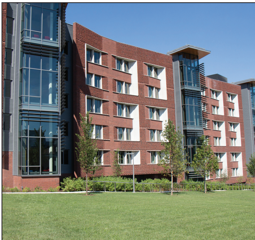
New College House

Returning graduate students apply to renew their housing in March. New graduate and professional students are assigned housing in order of the receipt of their application. Room changes are made during designated periods each semester if space is available. The dates are posted on Housing's website ( http://www.upenn.edu/housing ). Emergency room changes can be made at any time upon the recommendation of a College House Dean. If you have questions on room assignments or rent charges, call (215) 898-8271; questions or concerns about residential services, call (215) 898-3547; or questions about the College House programs, call (215) 898-5551.