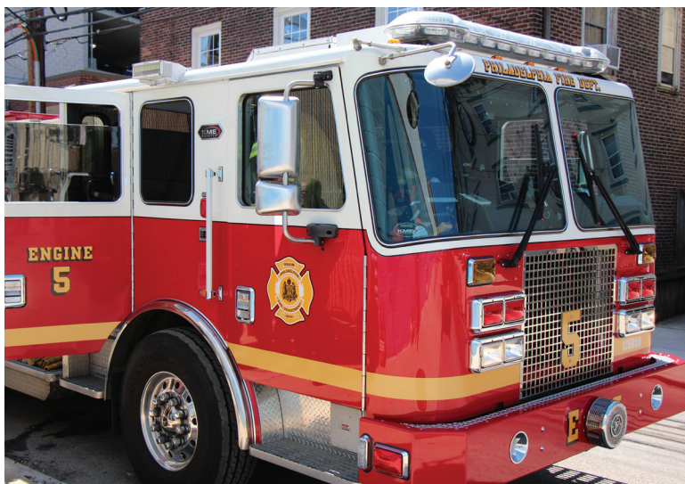
Philadelphia Fire Department, Engine 5

In the few areas where there is a functional fireplace, students must obtain approval for use. Before starting a fire, remove all combustible materials from the area and be sure the flue is open. Keep a screen in front of the fireplace while the fire is burning. Do not use liquid fuel starter and when using paper, limit the amount to avoid quick acceleration that could cause a flare up.